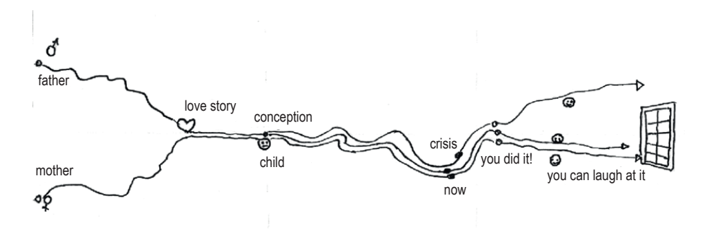
Fig. 1 – A diagram of the workflow of lifeline family therapy

The River of Life Model is diversely and broadly used as a therapeutic technique. It may be modified by the therapist in a number of ways depending on the therapeutic goal, the patient's individual characteristics and the specific setting in which treatment is offered.